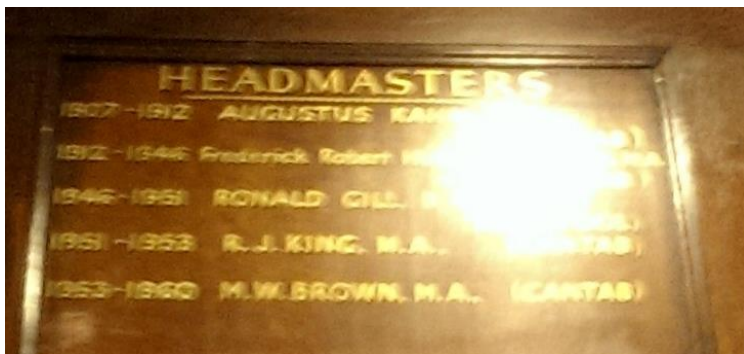
This one was hidden away and despite my poor cell phone camera effort I hope you can read the names of the Heads from 1912 to 1960.

More pictures have been added to the gallery section of the Web Site and I add two more now that were quickly snapped when in the Old school Hall in March.