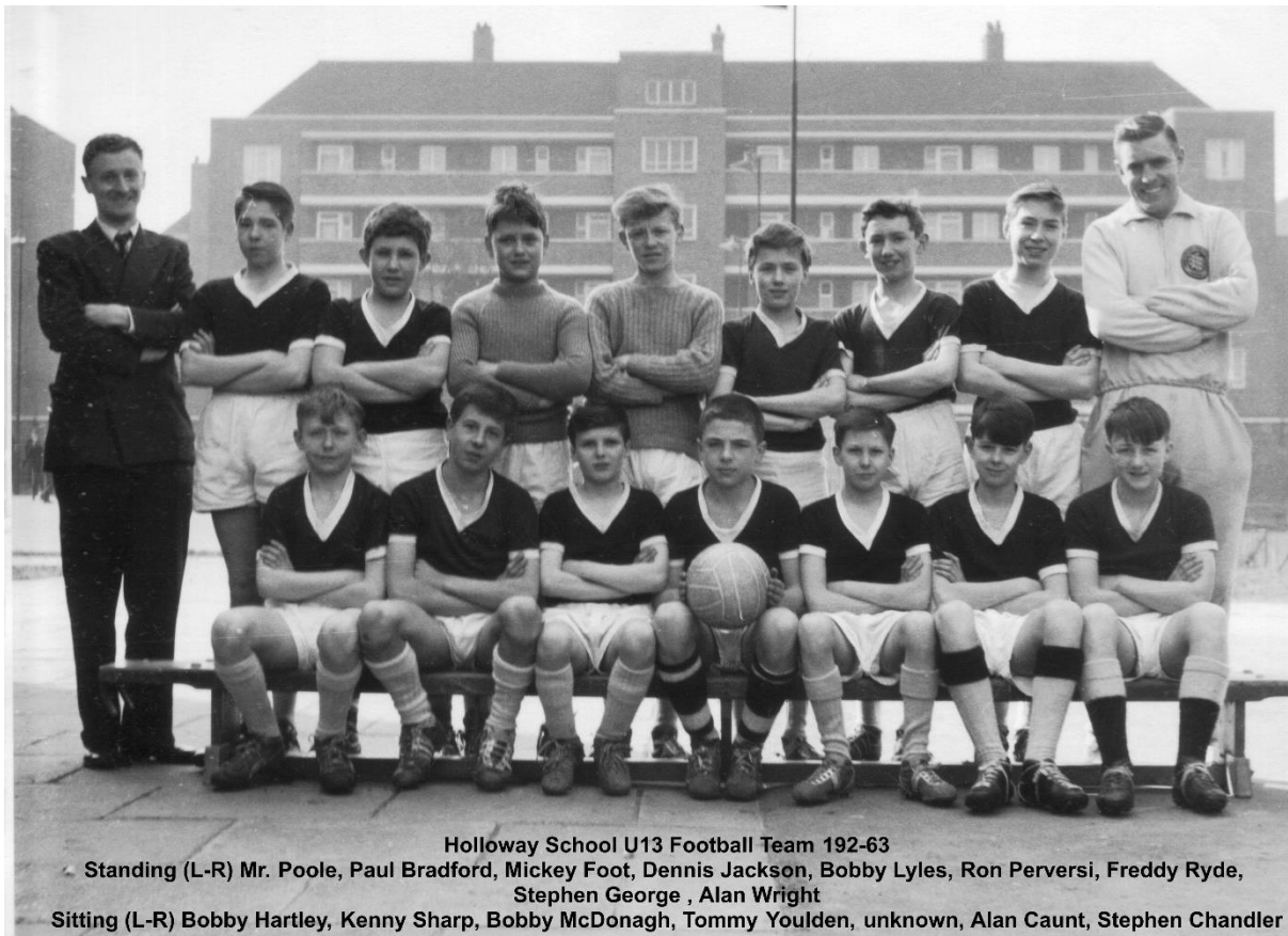
Holloway School U13 Football Team 1962-63

Also, there is a link from our website to www.beaconhigh.org and likewise. If you go to Beacon High School's website in the tab ' About Us ' you will find ' Community Links '. Click on that and you will see a tab entitled " Old Camdenians – Alumni Success Stories " that takes you straight to a link to our website http://www.oldcamdenians.info . Why not give it a try?